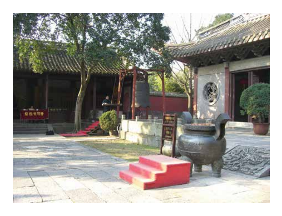
FIGURE II. The west-wing room before the fire (2006).