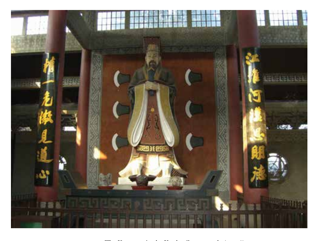
FIGURE 2. The Yu statue in the Yu the Great temple (2006).