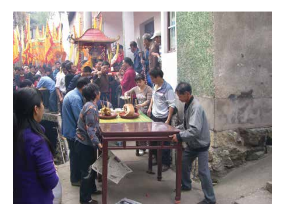
FIGURE 18. The sacrifice platform set up by Hudun villagers "greeting the god" at the Hudun Shun worship ceremony in 2009.