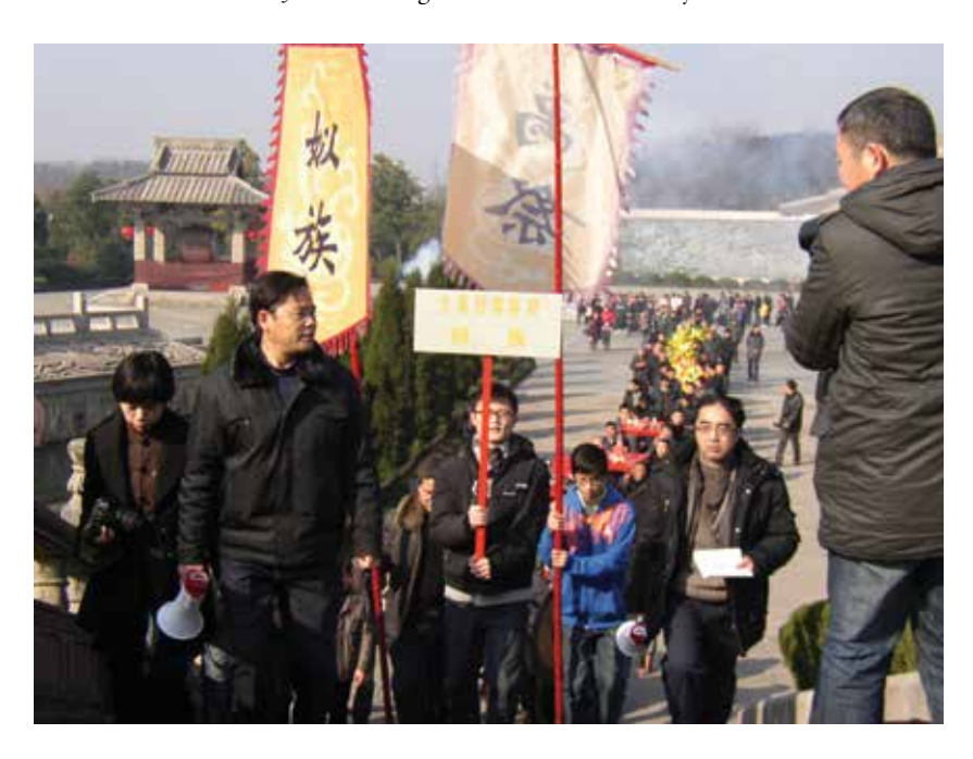
FIGURE 6. Marching toward Yu the Great temple on the Chinese New Year Day, 2011.