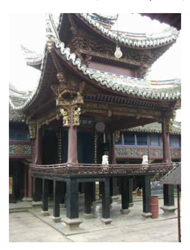
FIGURE 14. The opera stage (2007) in Shuangjiangxi Emperor Shun temple.