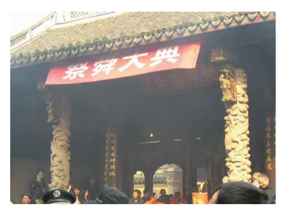
FIGURES 21 and 22. The grand Shun worship ceremony held by the Wangtan township government in 2010.