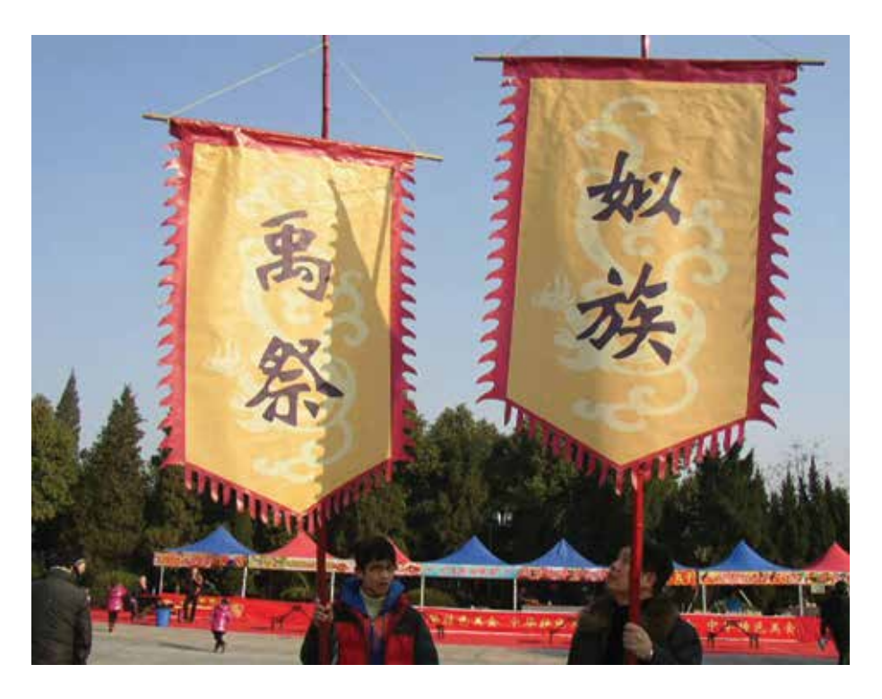
FIGURE 5. The clan flag used at the clan ceremony in 2011.