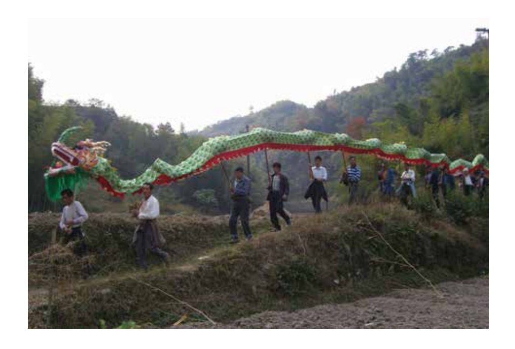
FIGURES 19 and 20. The green dragon society (top) and the yellow dragon society (bottom) "greeting the god" at the Hudun Shun worship ceremony in 2009.