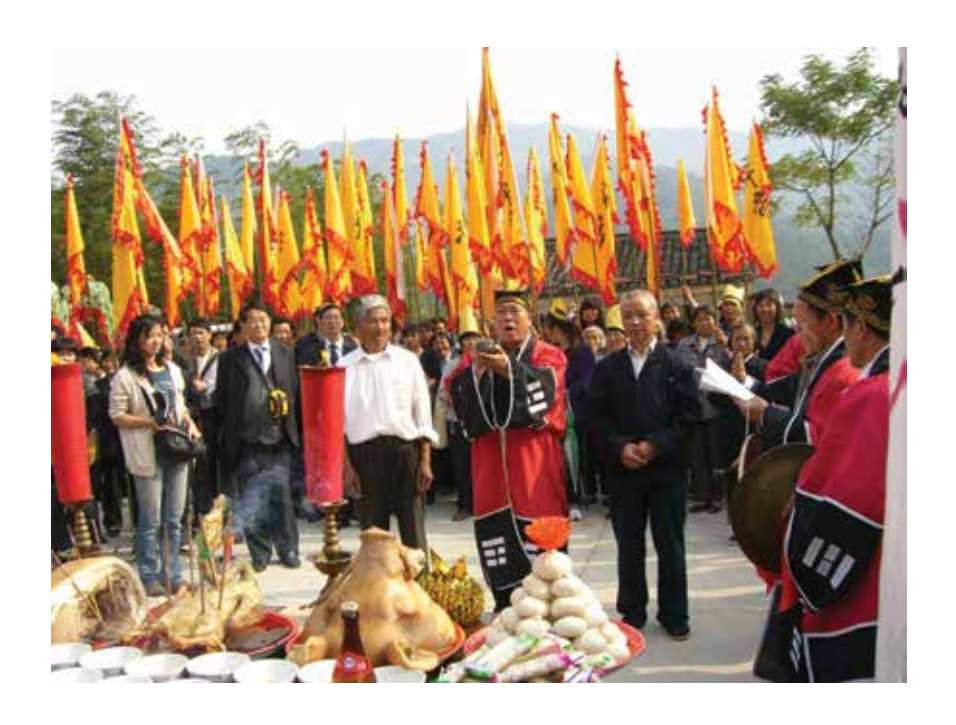
FIGURE 17. The lantern society ( denglmi 灯会) and flag society ( qilmi 旗会) "greeting the god" at the Hudun Shun worship ceremony in 2009.