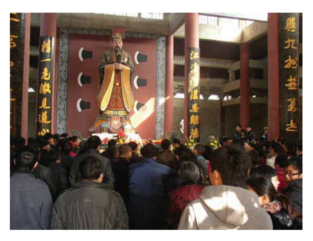
FIGURE 7. The clan ceremony at Yu the Great temple on the Chinese New Year Day, 2011.

following centuries, and included rituals in which the emperors of the Qing dynasty (1644–1911) participated. During the republic, two official Yu worship ceremonies took place. After a large-scale renovation of the Yu temple in 1933 and 1934, the Zhejiang provincial government organized a special ceremony on 16 October 1935. The other was hosted by the Shaoxing county government on 19 September 1936 (SHEN 1995, 200-12). An officially organized worship was not revived until about sixty years later when the Shaoxing municipal government in socialist China offered another ceremony in 1995, during which time the word "public worship" (gongji 公祭) began to circulate in the official discourse.