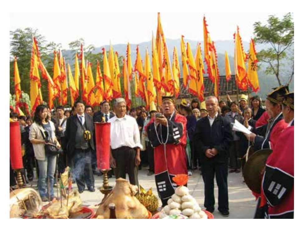
FIGURE 16. The Shun Worshipping Ceremony Held by Hudun villagers (2009).