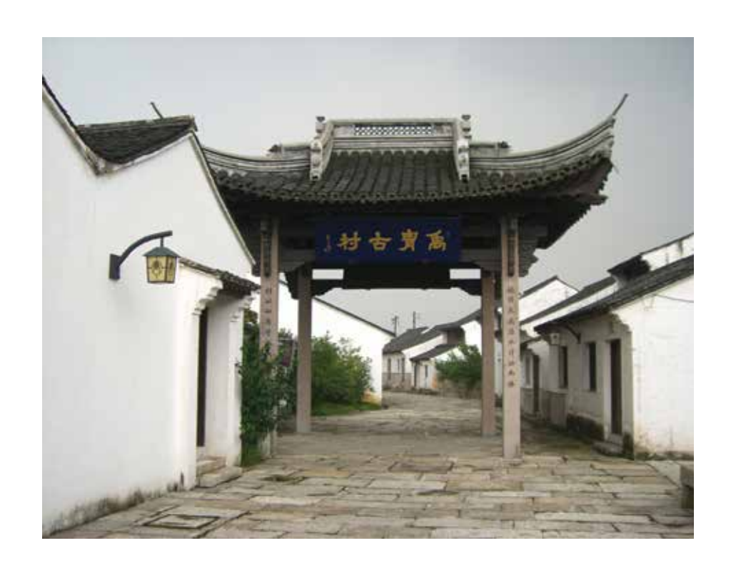
FIGURES 9 and 10. The empty Shouling village (2009).