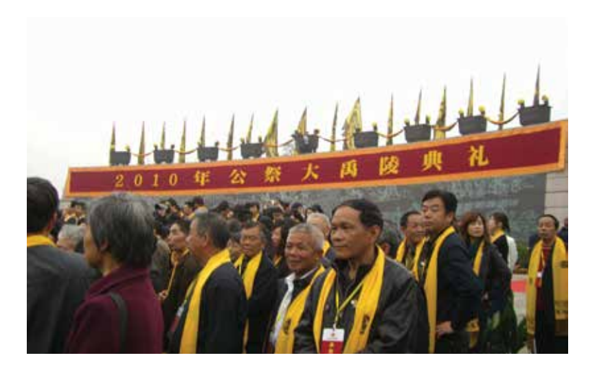
FIGURE 8. Public worship ceremony of the Yu tomb in 2010.

The 2006 practice can be seen as the turning point at which folk worship practiced by non-clan social groups was formally integrated into government-conducted public worship. All the nongovernmental social groups are still invited to participate, but for the sake of convenience, since 2007 the date of the ceremony has been set for 19, 20, and 21 April in the Western calendar, rather than the traditional observance of Yu's birthday on the fifth day of the third lunar month. This change shows the ways that officially-conducted public worship departs from folk tradition. Currently, the two ceremonies annually held by the Si clan in Yuling village still exist independent of the official worship, but as will be discussed later, their request to hold their ceremonies in the temple has met with an unfavorable response. At the same time, the local government invites the clan members to appear in the officially conducted public worship as a special group every year, thus showing a tendency to integrate the clan ceremony into the official ritual.