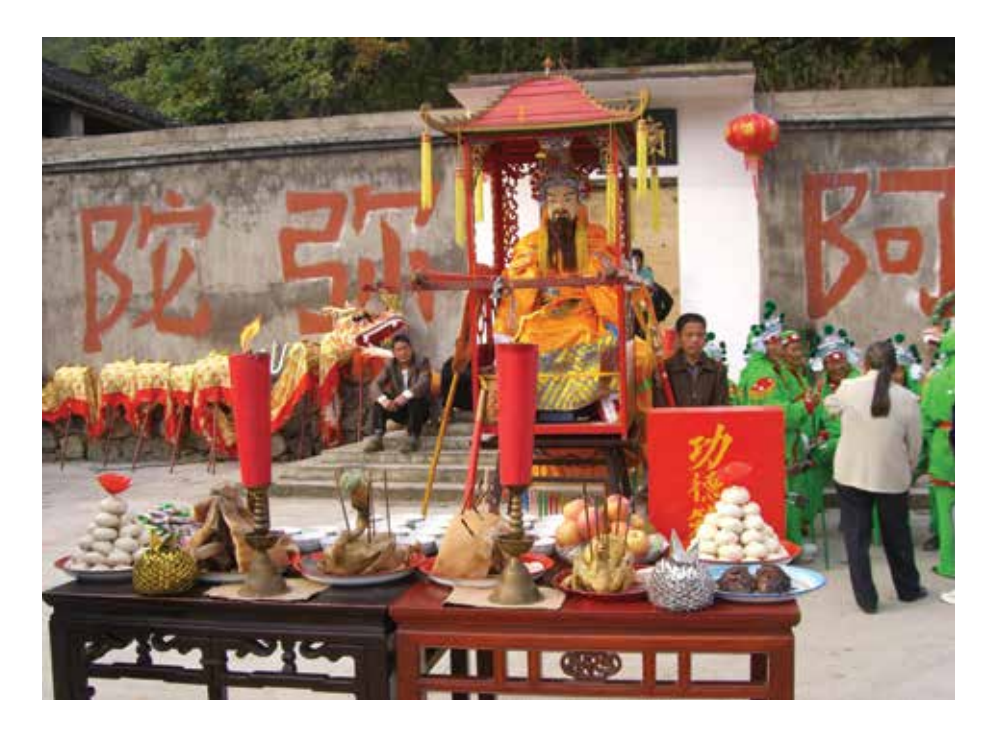
FIGURE 15. The statue of Emperor Shun in the Hudun Emperor Shun temple (2009).