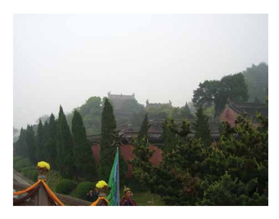
FIGURE 1. Yu the Great tomb in Shaoxing (2010).