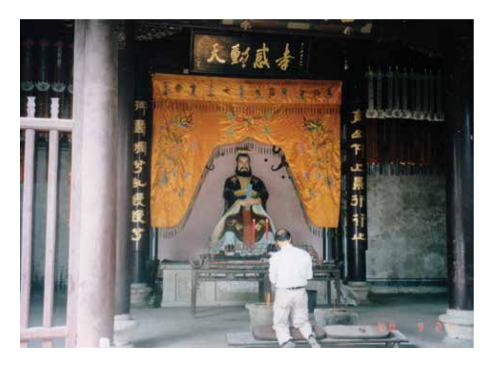
FIGURE 13. The statue of Emperor Shun (2005).